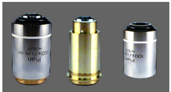
Objective Complete Internal Lens Assembly Decorative Collar